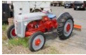
Restored 1946 Ford Tractor

Surplus Assets From the Continuing Operations of Plains Automotive